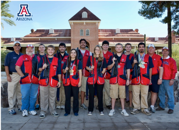
UNIVERSITY OF ARIZONA SHOTGUN TEAM 2012/2013

After a few meetings and some phone calls, the Provost and the Chief of Campus Police approved the request with some provisos such as no ammo, police escort and control of the weapons on to campus and off. It was funny to watch students and professors who walked by and do a double-take of the team